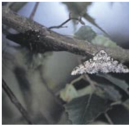
Cautionary tale: the classic account of industrial melanism in the peppered moth now looks flawed.

From time to time, evolutionists re-examine a classic experimental study and find, to their horror, that it is flawed or downright wrong. We no longer use chromosomal polymorphism in Drosophila pseudoobscura to demonstrate heterozygous advantage, flower-colour variation in Linanthus parryae to illustrate random genetic drift, or the viceroy and monarch butterflies to exemplify Batesian mimicry. Until now, however, the prize horse in our stable of examples has been the evolution of ‘industrial melanism’ in the peppered moth, Biston betularia , presented by most teachers and textbooks as the paradigm of natural selection and evolution occurring within a human lifetime. The re-examination of this tale is the centrepiece of