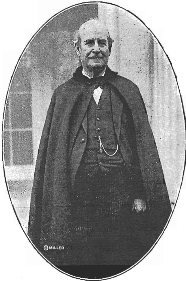
WILLIAM JENNINGS BRYAN

One of the last photographs taken of the Great Commoner upon his visit to President Coolidge at the White House